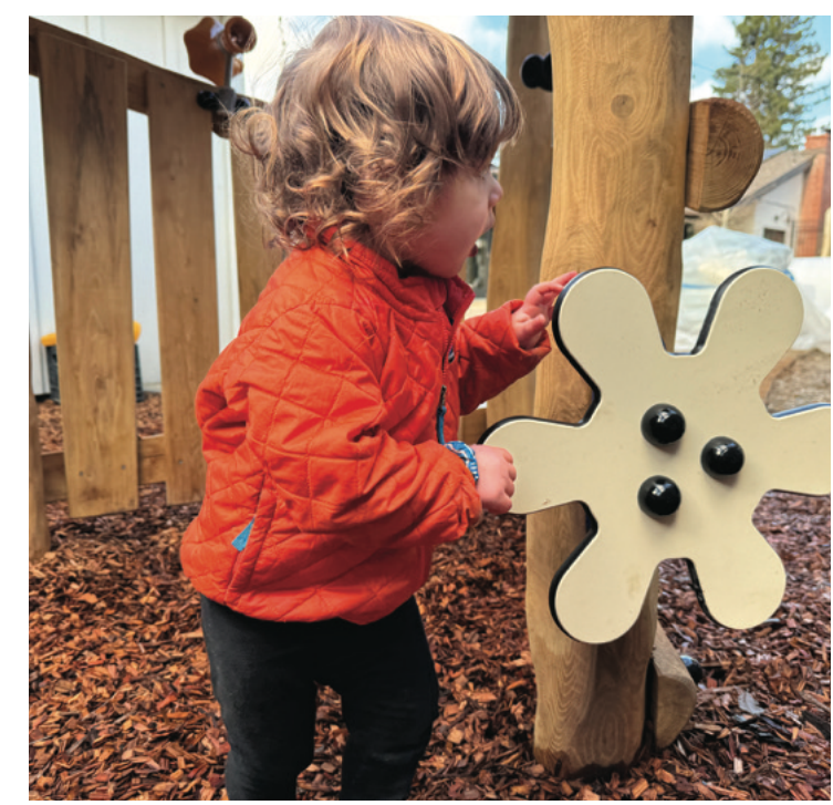
Above & right: The under 5 play area has been completed and is a lovely wooden ship structure which will also include a sand feature for young