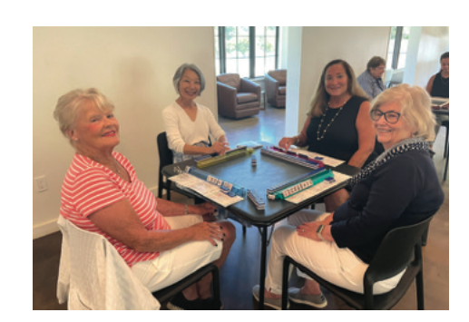
American Style Mah Jong : Thursdays 1:00 – 3:00 p.m.

You can always find the latest upcoming events at: <a href="mailto:shha.org/UpcomingEvents">shha.org/UpcomingEvents</a>