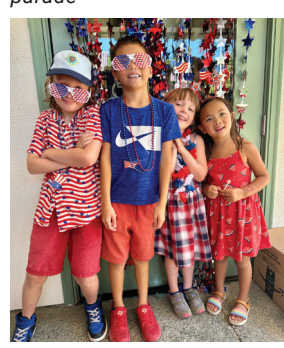
Above: Big cheeses from 4 little ones at the selfie backdrop Right: Triple C firetruck keeping us cool & safe