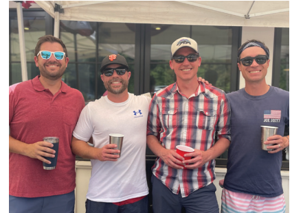
Above : Grill volunteers served 500 burgers & hot dogs