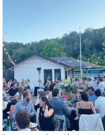
Above Left : The community center walkway was transformed for the evening Above Right : Guests enjoy dinner and live auction under the lights & stars