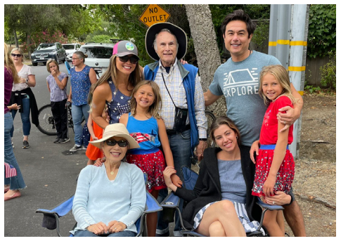
The Andrews and Hutchings families have the best fun on 4th of July!