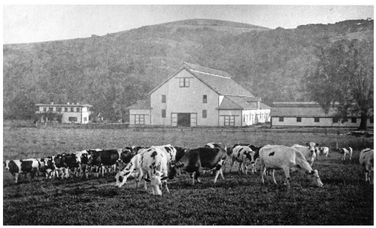
The Sleepy Hollow Dairy, ca. 1910, on open grassland.

The exhibit can be viewed daily 10 a.m. to 6 p.m. in the hallway outside the Historical Museum on the lower level of the San Anselmo Public Library until the end of October.