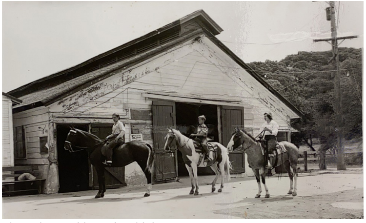
The Riding Stable, at the old dairy site, 1938 to 1970,