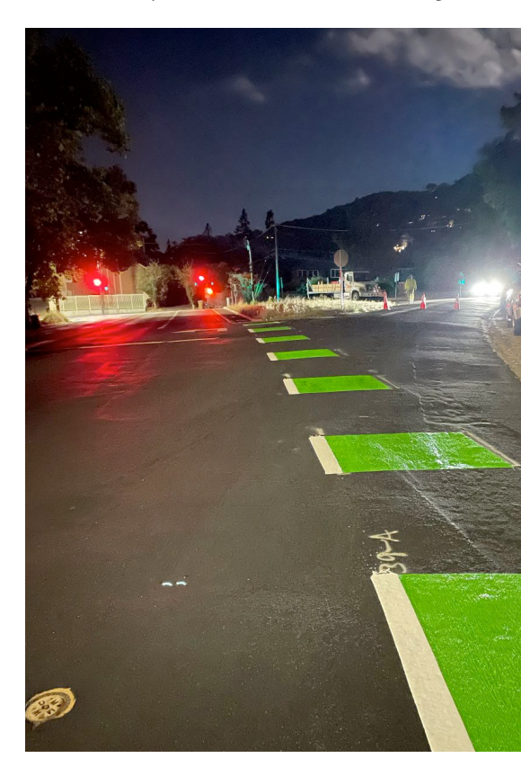
Butterfield bike lane improvements in San Anselmo

The Town of San Anselmo (in partnership with the safety committee) has been working