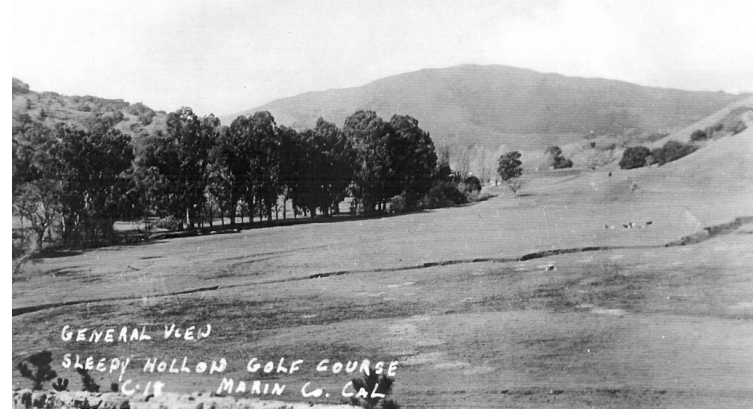
The Sleepy Hollow Golf Course opened in 1937.