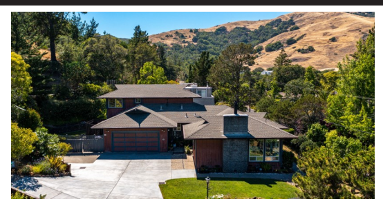
22 Dutch Valley Lane, Sleepy Hollow Price $1,895,000

Set on approximately .404 acres w/ views of the Loma Alta Hills and open space is this 2600+ sq. ft., custom built home. The house is original and owned by the original owner.