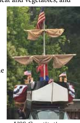
USS Constitution – 4th of July Float