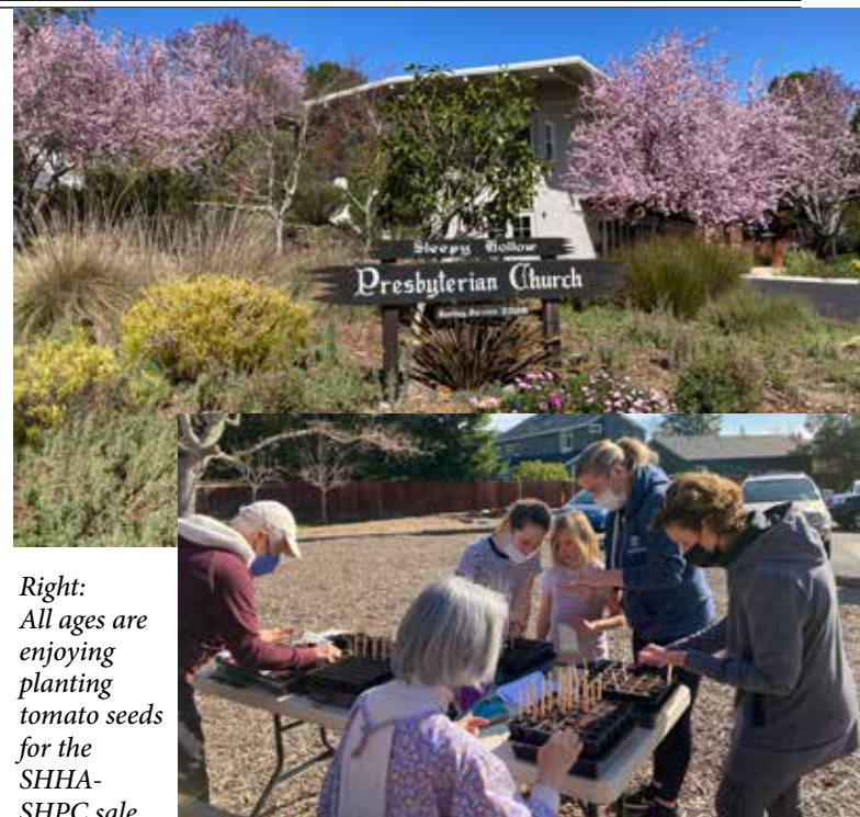
Right: All ages are enjoying planting tomato seeds for the SHHA-SHPC sale

The Rev. Bev Pastor, 415-453-8221, 415-446-8267 cell • shpchurch@comcast.net 100 Tarry Road, San Anselmo, CA 94960. www.sleepyhollowchurch.org