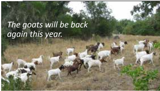
The goats will be back again this year.