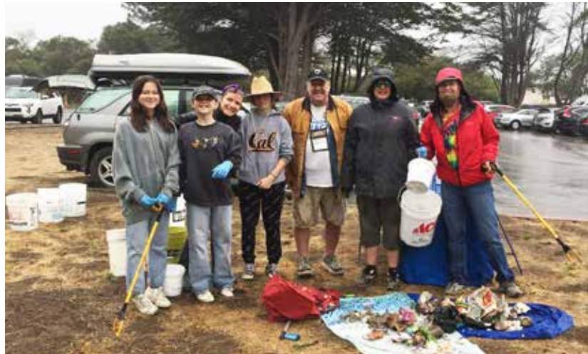
SHPC Green Team at Stinson Beach for California Coastal Clean Up Day with Surfrider of Marin

https://drivecleanbayarea.org/event/electric-vehicles-101/