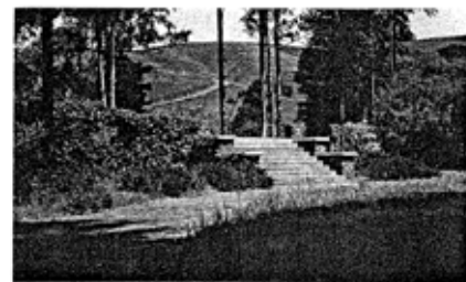
The steps and foundations of the house are all that remain today.